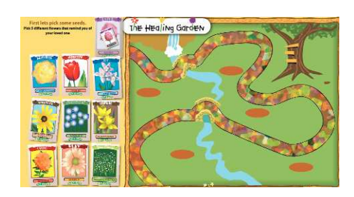
The Healing Garden A Place for Remembrance www.healingthespirit.org/healing_garden.htm