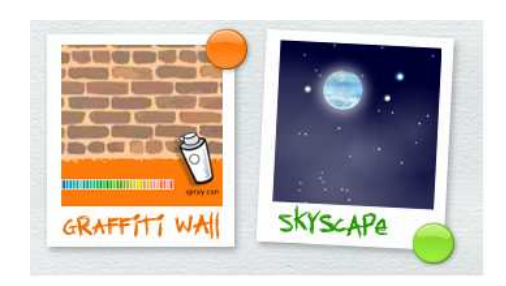
Winston's Wish Graffiti Wall & Skyscape www.winstonswish.org.uk/foryoungpeople/