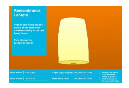
Grief Encounters Remembrance Lantern <a href="http://www.griefencounter.org.uk/lantern/light-a-lantern.html">http://www.griefencounter.org.uk/lantern/light-a-lantern.html</a>